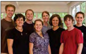
The Team in China