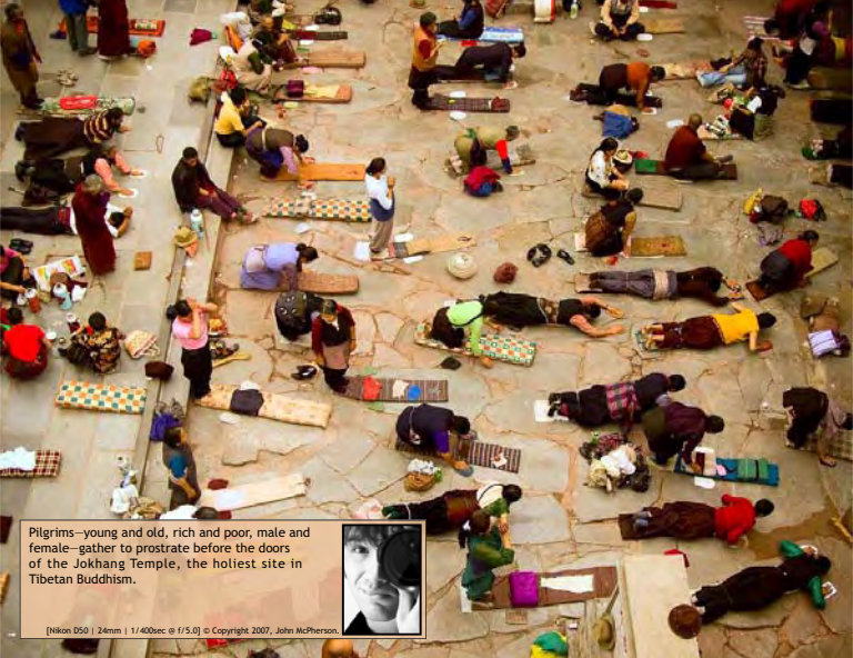
Pilgrims—young and old, rich and poor, male and female—gather to prostrate before the doors of the Jokhang Temple, the holiest site in Tibetan Buddhism.