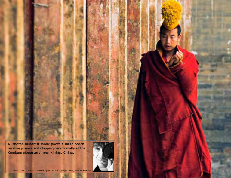
A Tibetan Buddhist monk paces a large porch, reciting prayers and clapping ceremonially at the Kumbum Monastery near Xining, China.